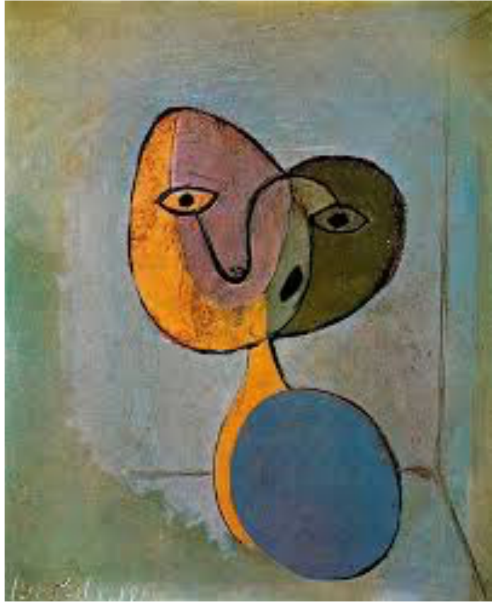
Pablo Picasso, Portrait of a Woman, 1936