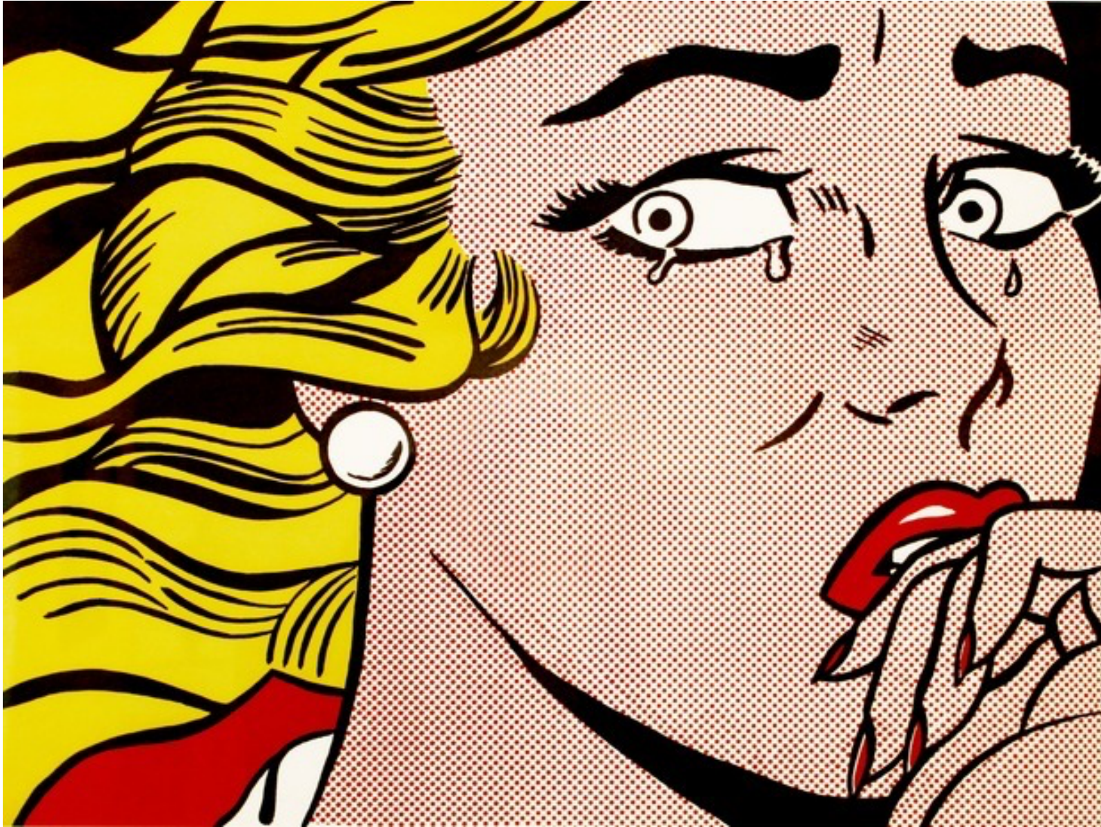
Roy Lichtenstein, 1960s