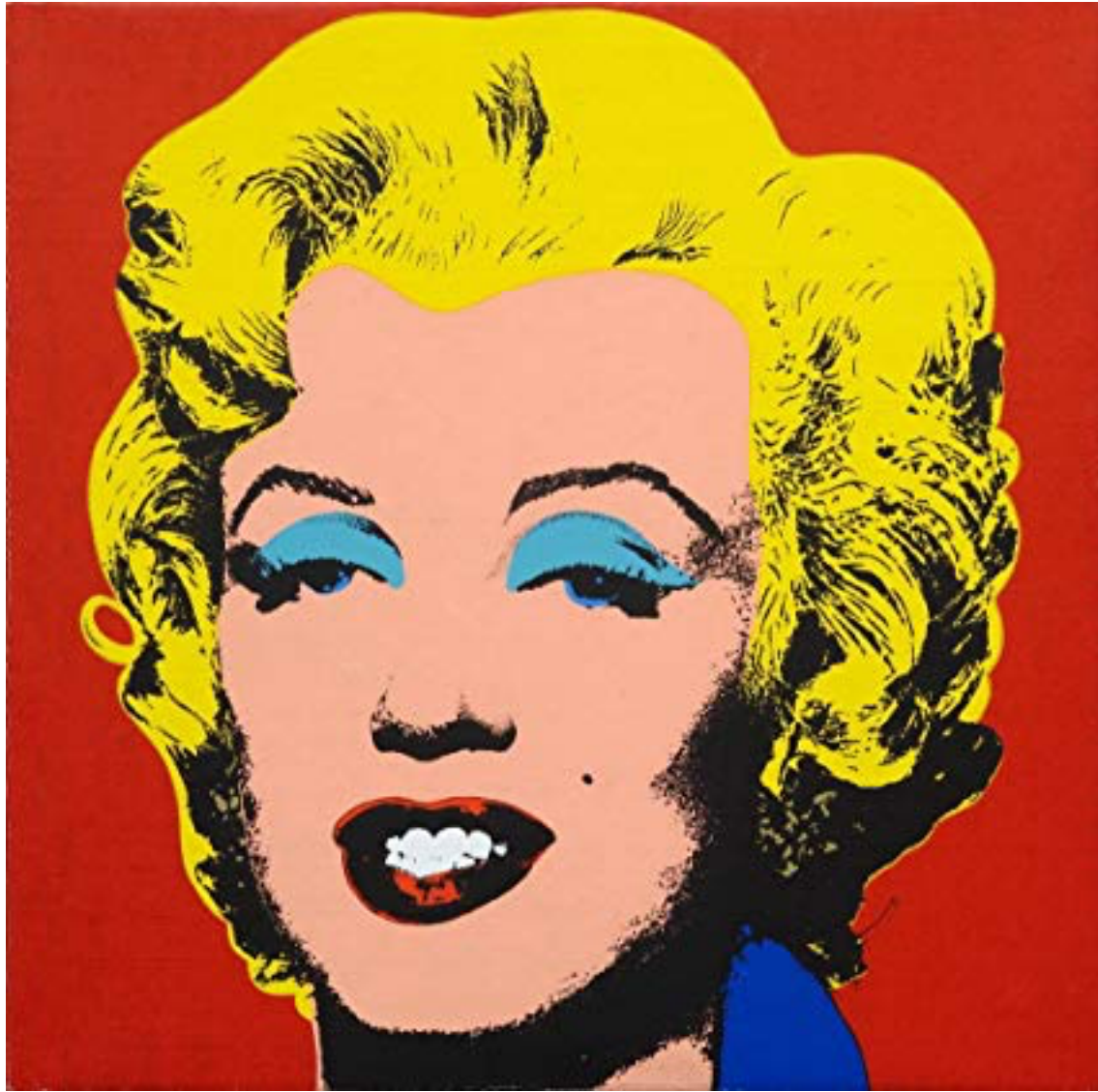
Andy Warhol, Marilyn Monroe, 1970s