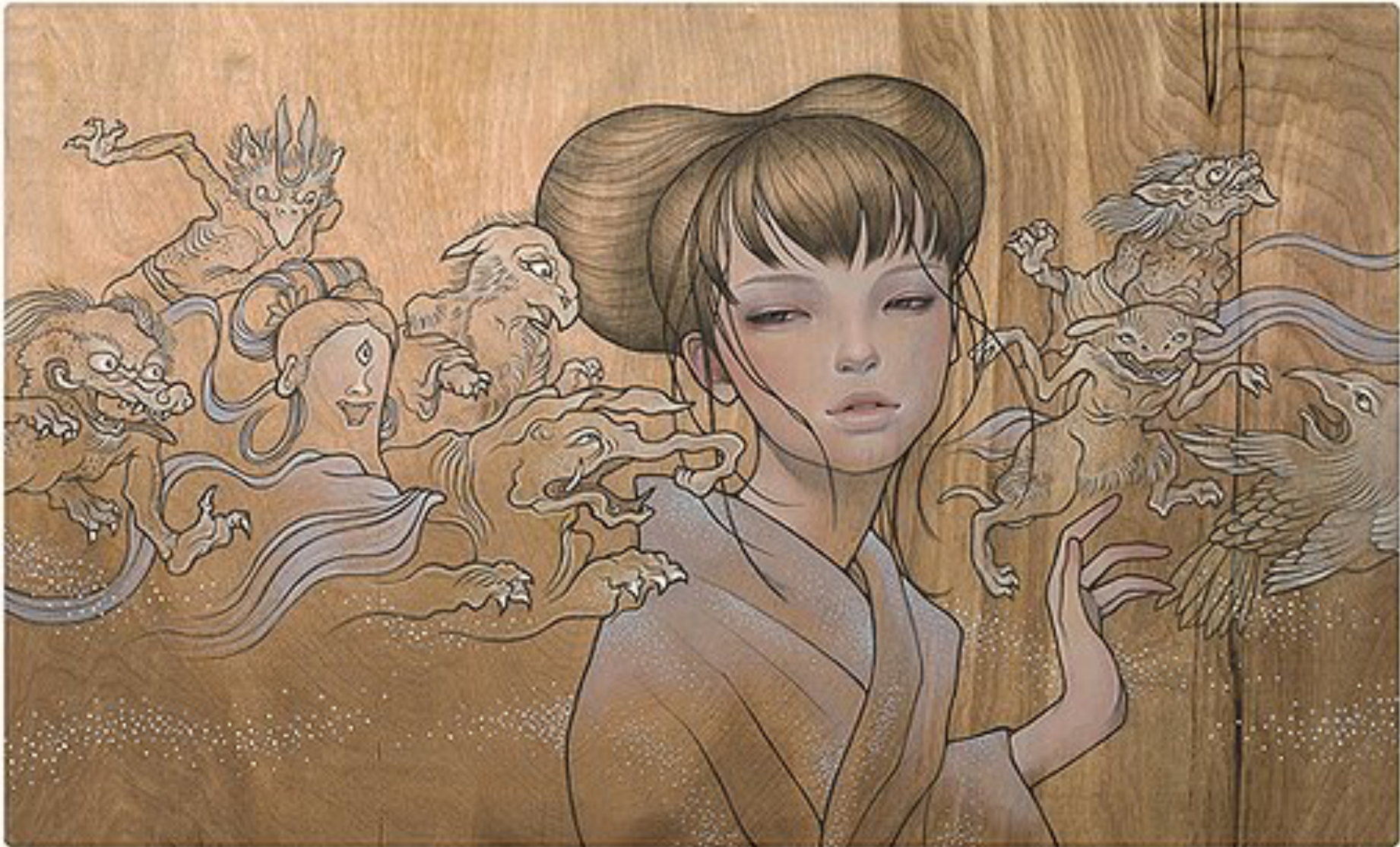
Audrey Kawasaki, 2000s