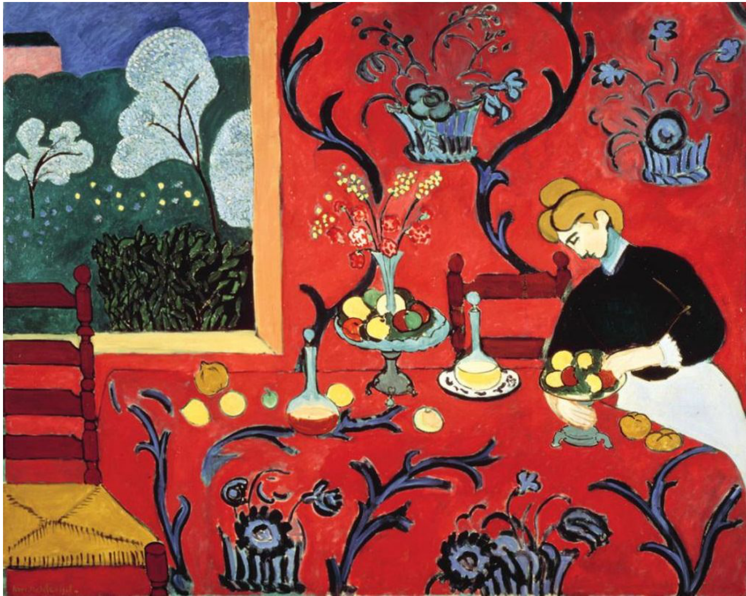
Henri Matisse, Red Room, 1908